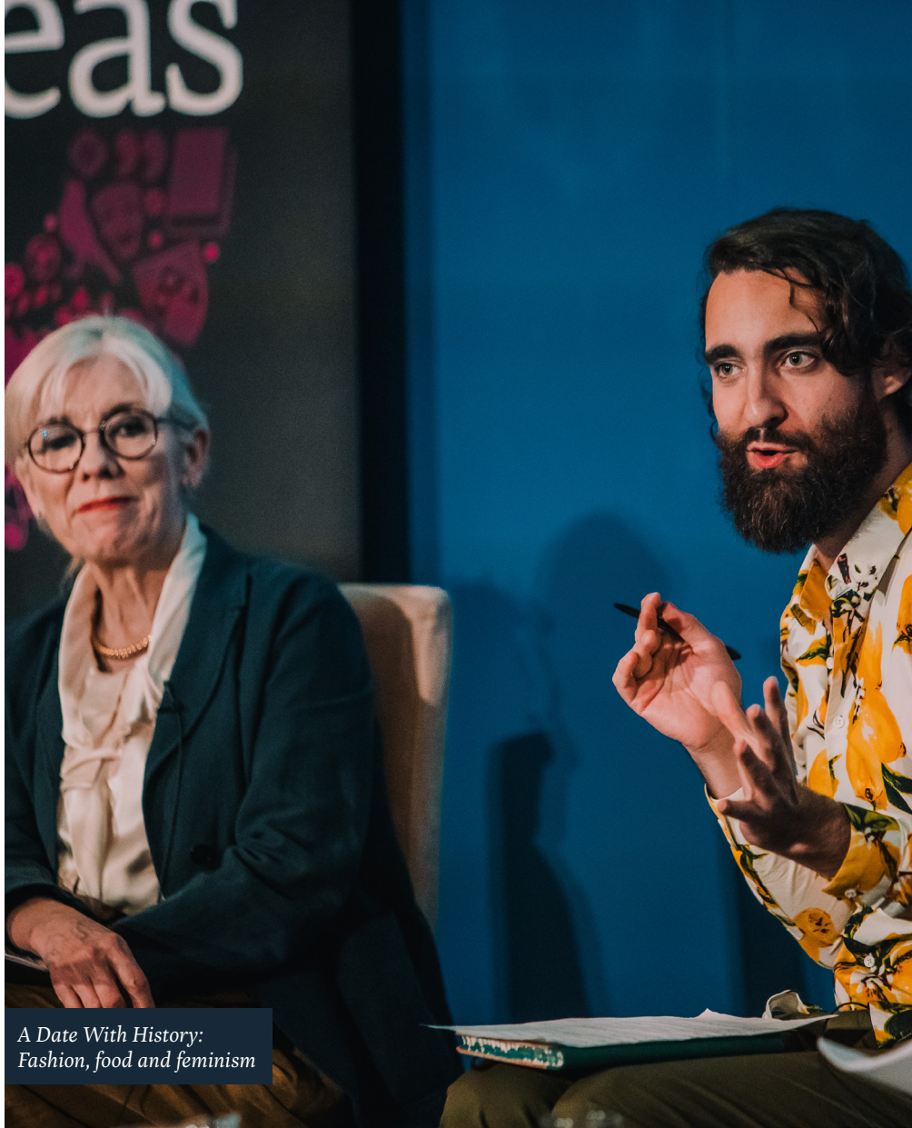
A Date With History: Fashion, food and feminism