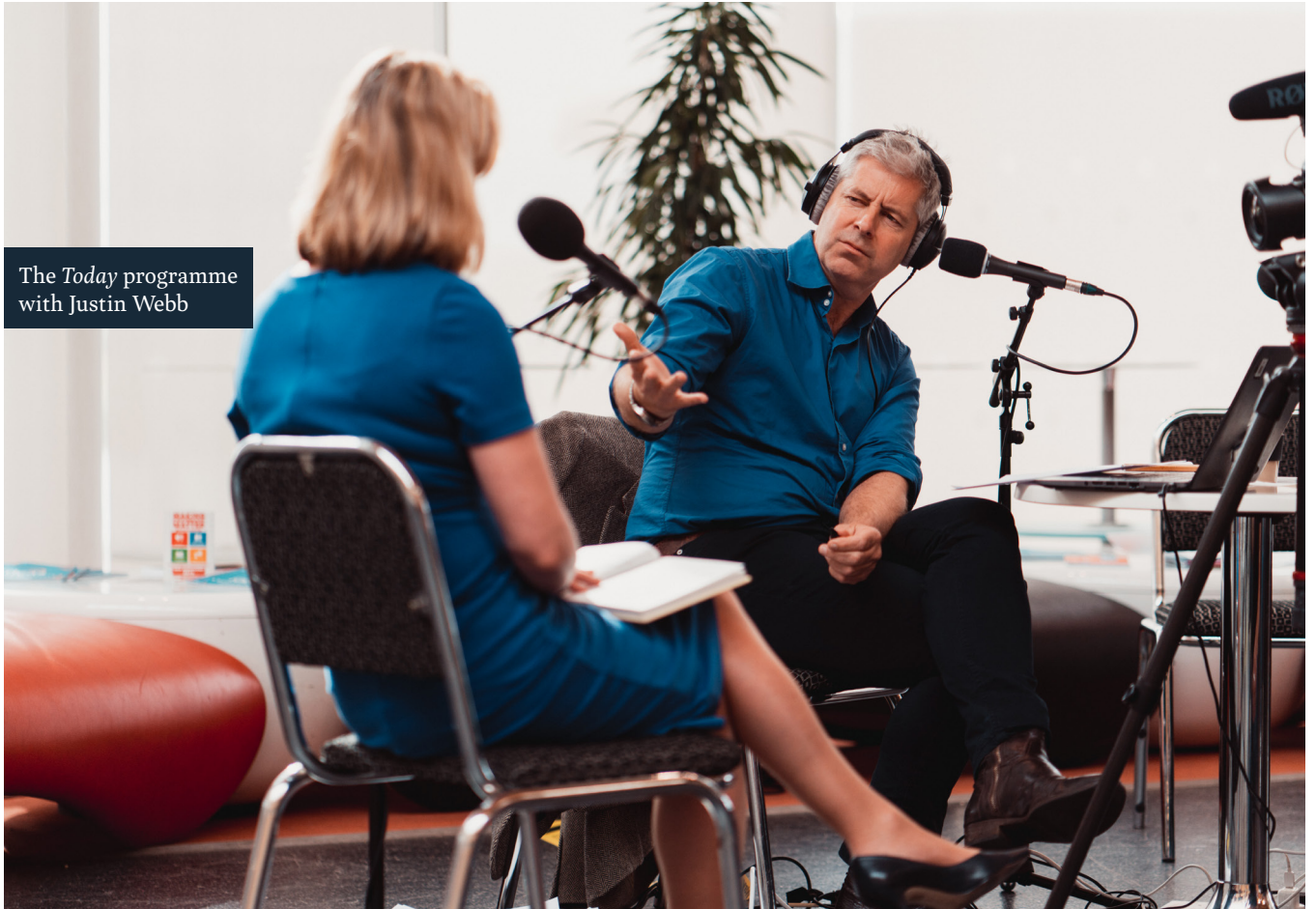
The Today programme with Justin Webb

As ever, this year's Festival brought a stellar line-up of world-class speakers to York. At the very dawn (quite literally) of the 2019 Festival, the BBC Radio 4 Today programme broadcast live from the University of York with an incredible line-up of guests.