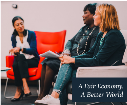
A Fair Economy. A Better World

This year seven Festival Focus Days illuminated important and topical issues by bringing together different voices and opinions at a series of themed events.